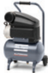
AF 20 E 10