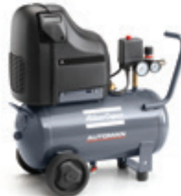
AH 15 E 24