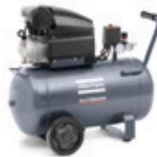
AF 25 E 50