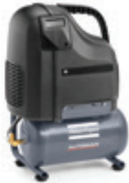
AH 10 E 6

AH series oil-free compressors are designed for a variety of applications. With no oil to replace and with the electric motor flanged to the compressor block, maintenance is reduced to the absolute minimum. Their all-aluminium, low-weight construction makes them the ideal choice when a smaller amount of compressed air is sufficient. They can be laid flat for transport.