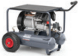
AF 30 E 2