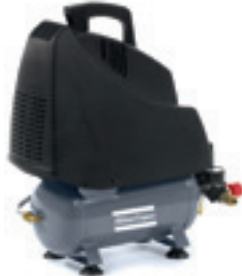
AH 15 E 6