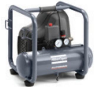
AH 20 E 6